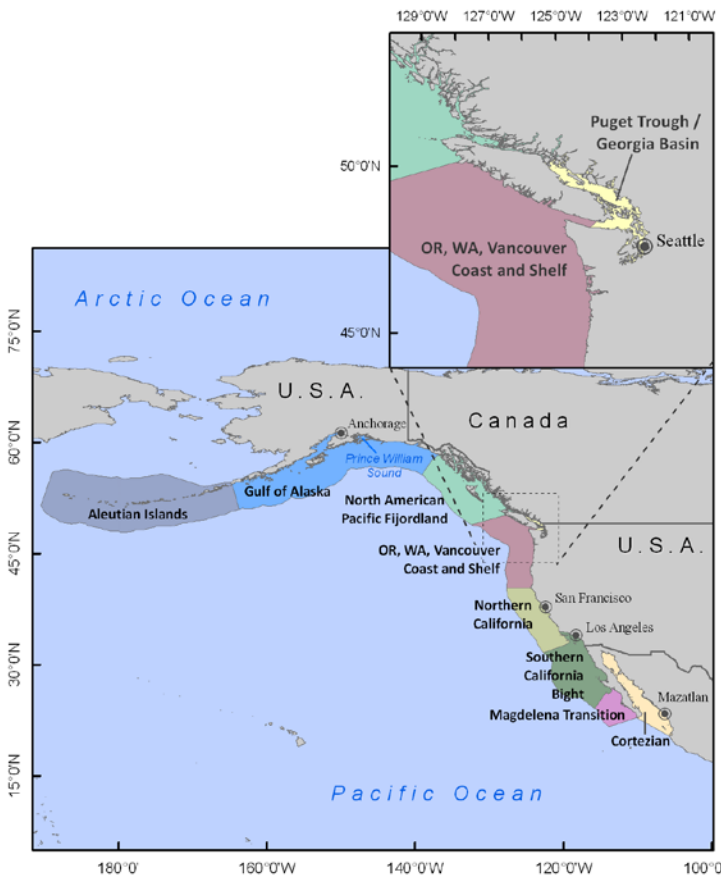
Figure 2: The 9 ecoregions from the Northeast Pacific (NEP) region, which extends from the Gulf of California to the Aleutian Islands.